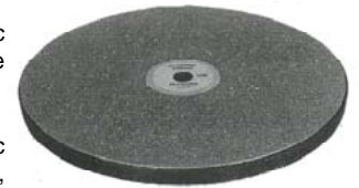
AMERITOOOL DIAMOND DISCS

AMERITOOOL DIAMOND DISCS are precision diamond discs bonded to a plastic backing plate. These discs offer a flat parallel grinding surface face for faceting, inlay, general lapidary and glass grinding applications. Also great for carbide and high speed steel tool grinding and shaping. Discs come with a 1/2" arbor hole.