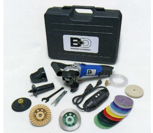
The BD-125 Wet Diamond Grinder/Sander/Polisher Kit